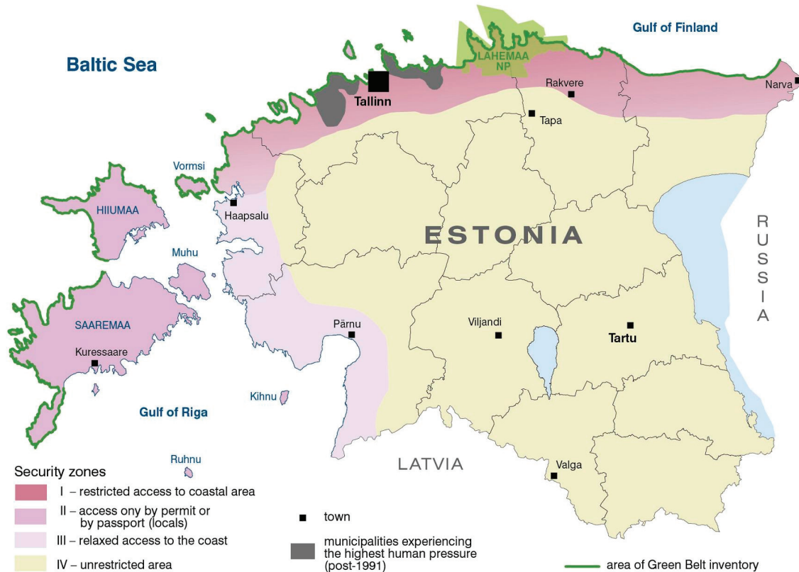
Figure 1: Security zones of the Estonian Soviet Socialist Republic 1945-1991.

These harsh restrictions were accompanied by drastic changes in the former way of life – many residents were forced to leave, traditional ways of land use dwindled and a number of manmade objects and values were left to face the forces of nature. But, as is often the case, this also had some positive impacts. Not considering the border guard, ports, and fishing kolkhozes, almost no development or construction activities took place on Estonian coastal areas. Partly thanks to that, these areas are still well preserved and in a relatively untouched state.